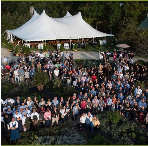
@farmerleejones Group Shot #rootsinnovate2017

Thank you to everyone who participated in/attended this year's successful Roots Innovate 2017 Conference! If you weren't able to make it, there's always next year. In the meantime, you can check out the pictures below or follow the hashtag #RootsInnovate2017 to see snapshots of the conference. We can't wait to see you next year!