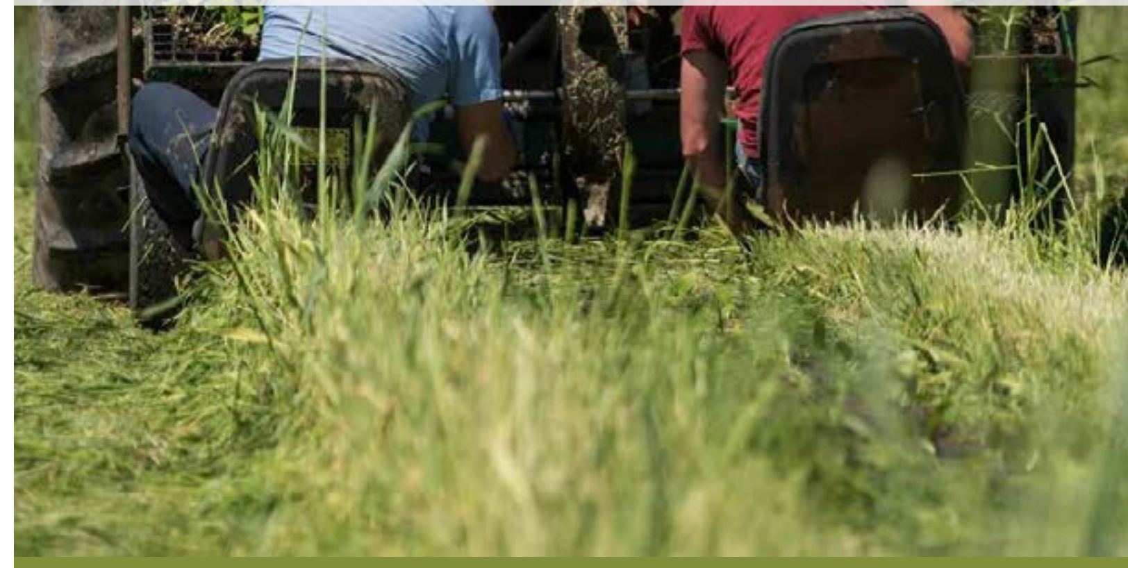
Product availability is weather dependent and is subject to change. Product images are not to scale.