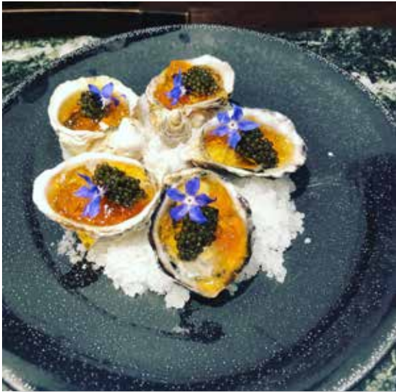
Kusshi oyster with dashi gel, Siberian caviar and blue borage

The Chef's Garden was built because of the Chefs' love for Microgreens, Heirloom Vegetables, Specialty Lettuce and Edible Herbs and Flowers. We want to feature you, the Chefs, and the reason we decided to become The Chef's Garden. Get creative and share your photos of our products in the kitchen, finished dishes and plates at the pass. Post your dishes to our Facebook page. Tag your dishes on Twitter @TheChefsGarden. Use the hashtag #thechefsgarden on Instagram or send us an email: marketing@chefs-garden.com .