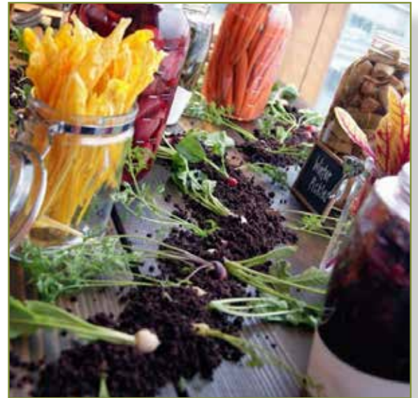
@chefadamsalyer Winter Vegetables - Raw & Pickled #vegetables #meetingsimagined #foodphotography #mhmarquiswdc #pickledvegetables #winterfood #thechefsgarden