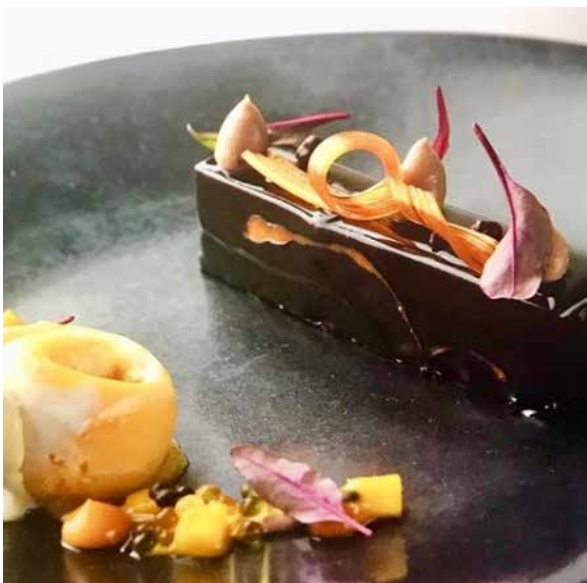
@sylvainmarrari New Valrhona chocolate bar on the menu , Almond stressel , mango passion gel , Milk chocolate mousse with vanilla long pepper ice cream & mango passion sorbet . @theartofplating #chefstalk #dessert #foodporn #pastry #sylvainmarrari #art #love #foodie #glutenfree #yummy #farmerleejones