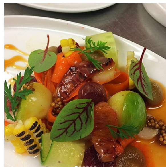
@3 course luncheon | vegetable crudo | @orakingusa salmon with Parmesan mushroom panna cotta | deconstructed banana split