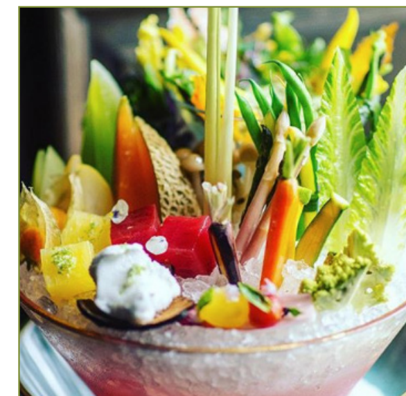
@michaeldengelegi No matter how many times you look at this dish it never gets old. The flavors and textures are like a full tasting menu in one dish.