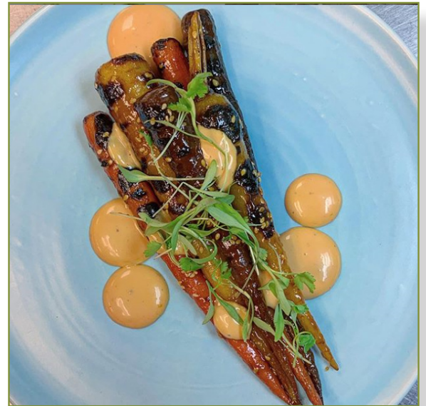
@chefgrantirvin Miso glazed carrots