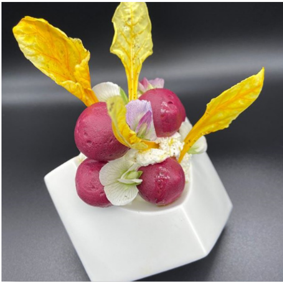
@rosendale_events Beet Macaroons with Goat Cheese Mouss Ingredients: Bulls Blood Beets Sunrise Beet Blush Pea Blooms Goat Cheese

The Chef's Garden was built because of the Chefs' love for Microgreens, Heirloom Vegetables, Specialty Lettuce and Edible Herbs and Flowers. We want to feature you, the Chefs, and the reason we decided to become The Chef's Garden. Get creative and share your photos of our products in the kitchen, finished dishes and plates at the pass. Post your dishes to our Facebook page. Tag your dishes on Twitter @TheChefsGarden. Use the hashtag #thechefsgarden on Instagram or send us an email: marketing@chefs-garden.com .