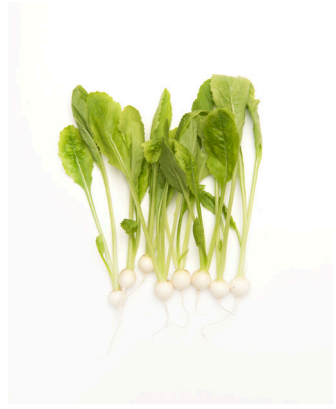
Petite White Turnip