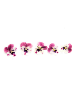
Red Raspberry Sorbet Viola