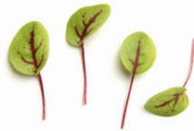
Red Ribbon Sorrel