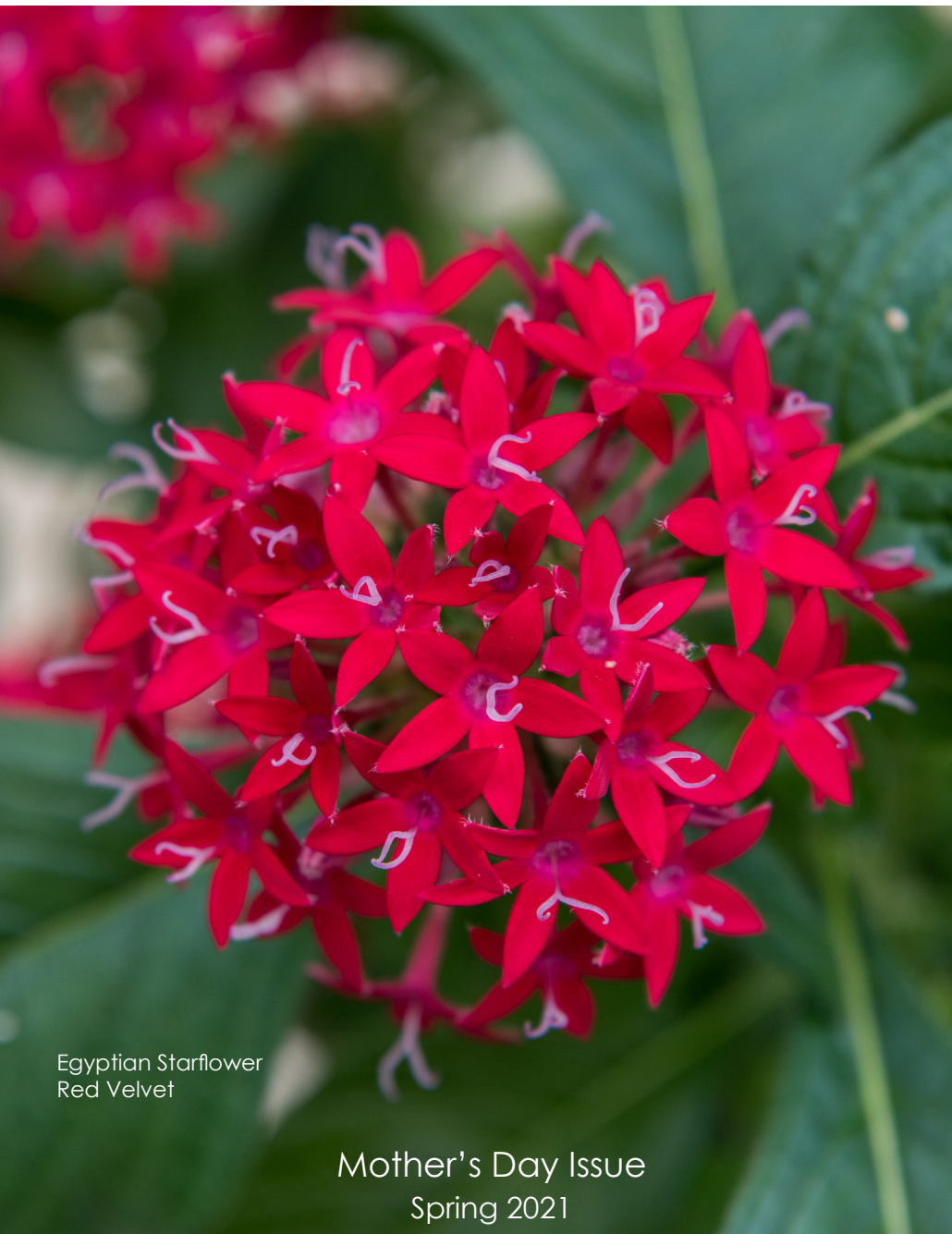
Egyptian Starflower Red Velvet