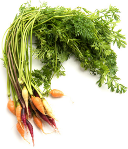
Petite Mixed Carrots