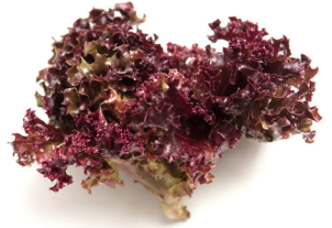
Ultra Lolla Rossa