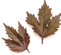
Red Hibiscus Leaves