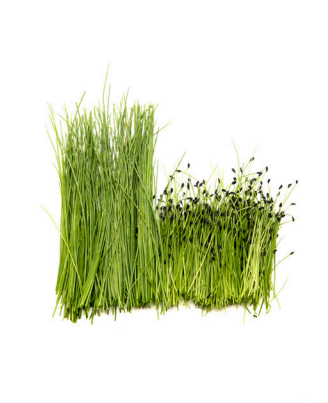
Memo + Micro Chives