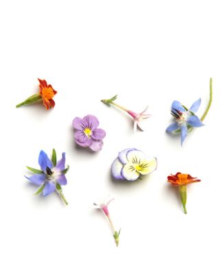
Mini Sorbet Princess