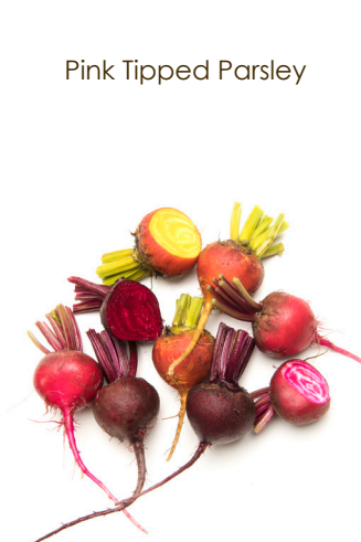
Mixed Baby Beets