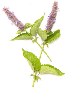
Anise Hyssop Blooms