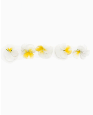
Banana Cream Viola