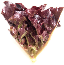
Ultra Red Oak