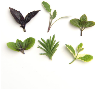
Demi Herb Sampler