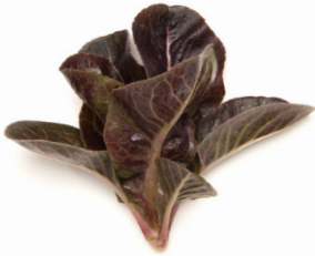
Ultra Red Rose Romaine