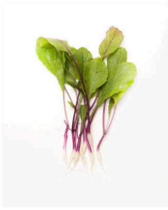
Petite Royal Purple Turnip