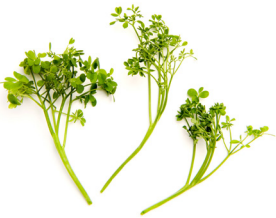
Calvin Pea Tendrils