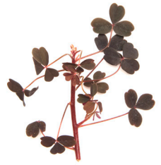
Plum Lucky Sorrel