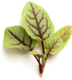
Petite Red Ribbon Sorrel