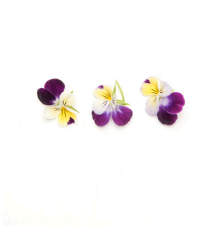
Lemon Plum Johnny Jump Ups