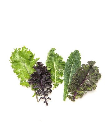
Mixed Baby Kale