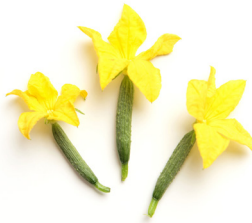
Cuke with Bloom