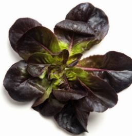
Ultra Red Rosettes