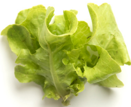
Ultra Green Oak