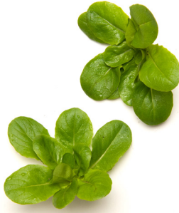
Ultra Green Rosettes