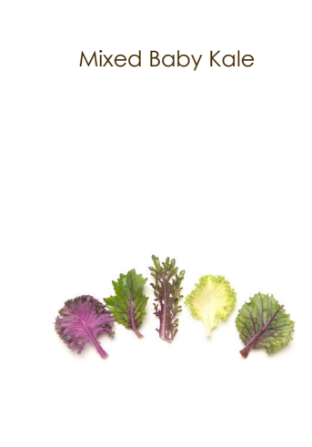
Petite Exotic Kale