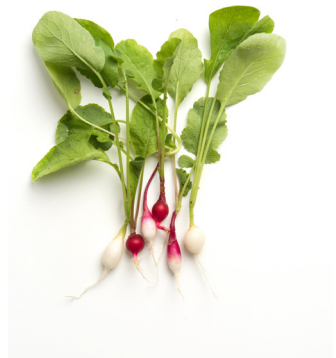
Petite Mixed Radish