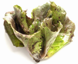
Ultra Speckled Density