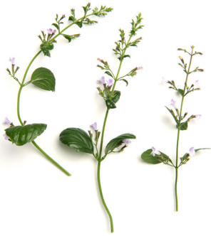
Nepitella Mint Blooms