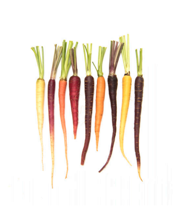
Mixed Baby Carrots