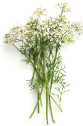
Citrus Coriander Blooms