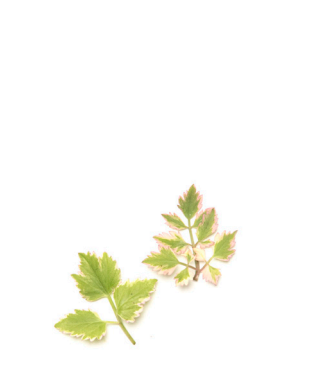
Pink Tipped Parsley