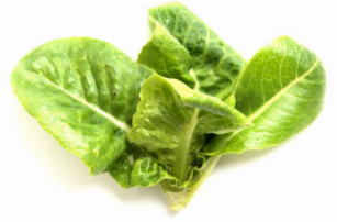
Ultra Sweet Romaine