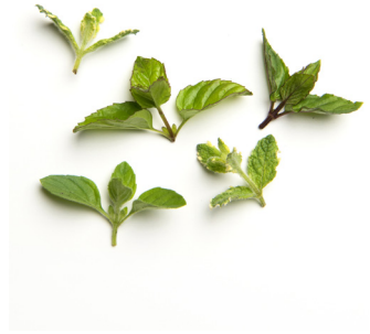
Demi Mint Sampler