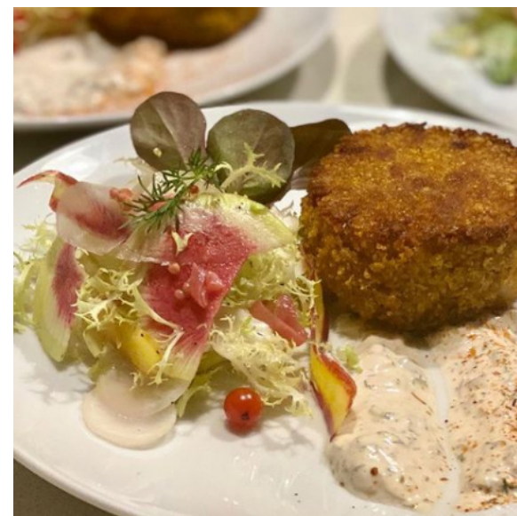
@westchesterculinarysociety Crabcakes are always on the menu. Always. Creole remoulade and shaved vegetable accouterments.