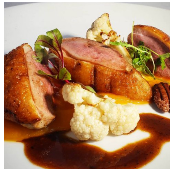
@blueduckeats Crispy Duck with Butternut Squash Puree

The Chef's Garden was built because of the Chefs' love for Microgreens, Heirloom Vegetables, Specialty Lettuce and Edible Herbs and Flowers. We want to feature you, the Chefs, and the reason we decided to become The Chef's Garden. Get creative and share your photos of our products in the kitchen, finished dishes and plates at the pass. Post your dishes to our Facebook page. Tag your dishes on Twitter @TheChefsGarden. Use the hashtag #thechefsgarden on Instagram or send us an email: marketing@chefs-garden.com.