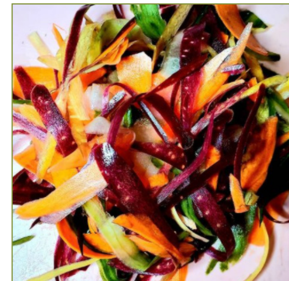
@lasokitchen Ribbons to die for.