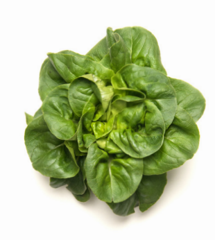
ultra green rosette 25ct (09GLRO-24)