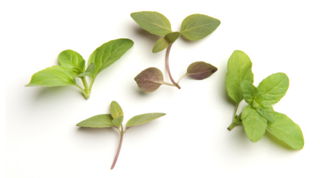
mint sampler (14MMS-33-E)