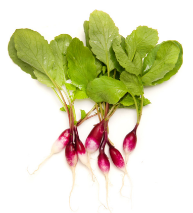
imperial breakfast radish 50ct (01PIR-33)