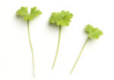
red ribbon sorrel (04MRRS-33-E)