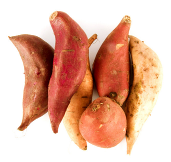
mixed baby sweet potatoes 5# (01MHBSP-5)