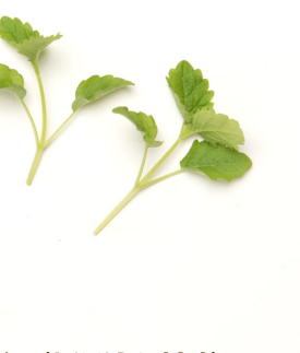
lemon balm (14MLBA-33-S)