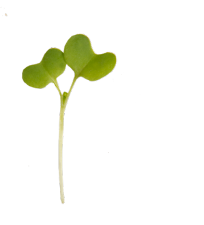
red mustard (04RM-33-L)