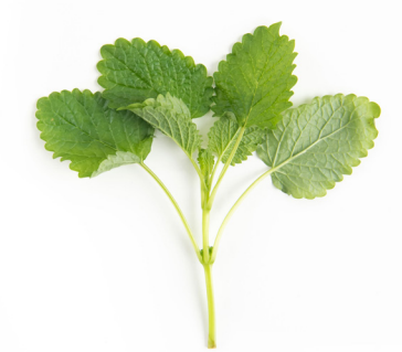
citrus lace 50ct (05CMLV-33)