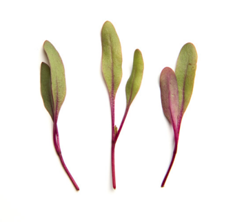
bulls blood (04BB-33-S)