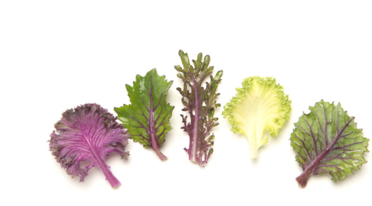
petite exotic kale 50ct (07PKM-33)