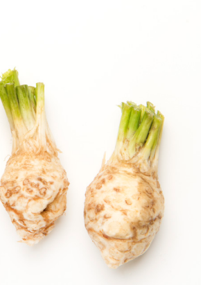
baby celery root # (01DC-2)