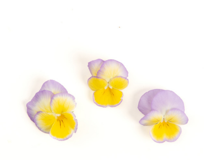
lilac lemonade pansy 50ct (05LLPAN-24)