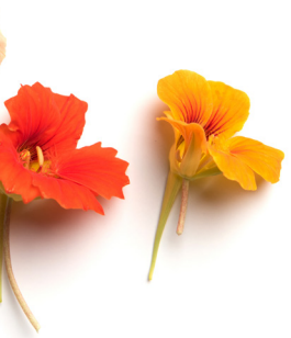
nasturtiums 50ct (05NSF-24)