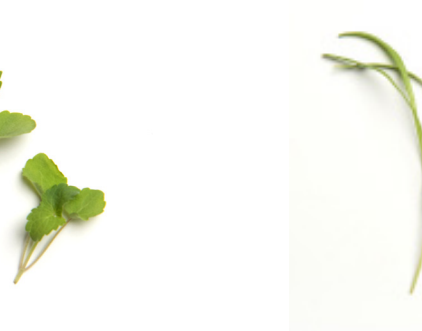
anise hyssop (14MAH-33-S)