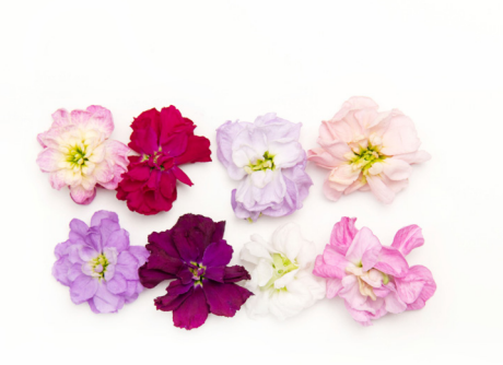
mixed mini floret 50ct (05MFLO-24)