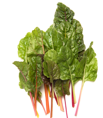
young rainbow swiss chard # (04RCY-2)