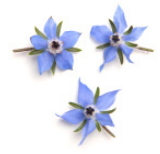
blue borage flower 50ct (05BBOF-24)