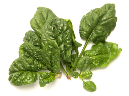
root spinach 10# (04RSPI-10)