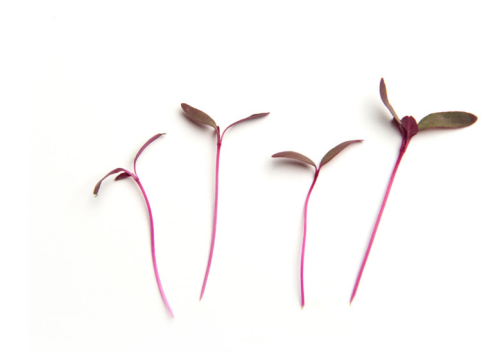
burgundy amaranth (04BAM-33-S)