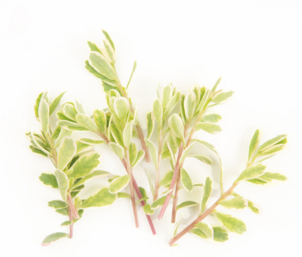
variegated purslane 25ct (08VPUR-33)