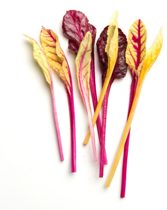
mixed beet blush 25ct (01MXBB-33)