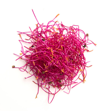
beet of the night (04MBN-33-E)