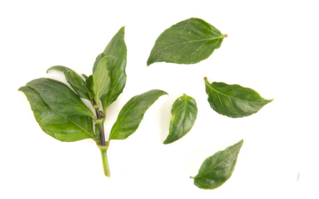
mushroom leaf sprig 25ct (08MRL-33)