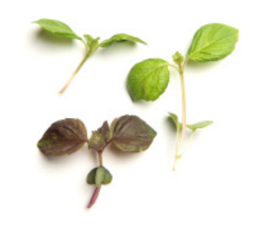
mixed shiso (04MSM-33-L)