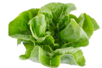
Sweet Romaine succulent leaves with notes of celery & watercress. crisp & substantial