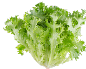
Green Tango sharp-tipped ruffled leaves with notes of hops, nicely balanced between sweet & bitter