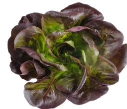
Red Rosette a broad head with tender petal-like leaves. slightly bitter & savory with notes of parsnip