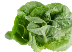
Green Romaine spoon-shaped leaves with a snappy crispness. Initially sweet with a bitter finish