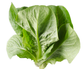
Baby (b) Lettuce 4"-6" sold by pound