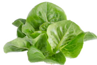
Green Bibb succulent & buttery with a raw pea finish