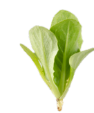
Petite (p) Lettuce 2"-3" sold by 50 ct. pkg.

*Lettuces in this guide are shown in Baby size. Most are also available in Petite and Ultra as well. Please ask your product specialist about sizing options for individual varieties.