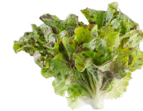
Speckled Crispleaf mildly bitter with sweet radish notes *petite only