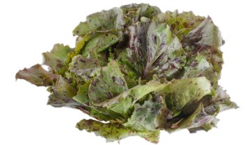
Speckled Density tender, mild & clean with light walnut notes & full, round mouthfeel