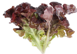
Red Oak tender, smooth oak-shaped leaves. crisp stems. mildly bitter with a clean, sweet finish.