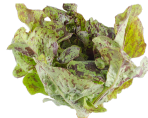
Painted Oak mild, earthy & balanced. speckled oak-shaped leaves with hints of carrot *petite only