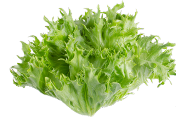
Reine D' Glaces succulent leaves with prominent veins. earthy & savory, with notes of carrot & celery. sweet at the stem, bitter at the tips