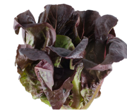
Outredgeous loose, red Romaine with crisp texture & mild flavor

"Outredgeous" is the first-ever lettuce to be grown in space -- aboard the International Space Station during Expedition 44 in August 2015. The experiment was part of NASA's attempts to provide future astronauts with a sustainable food source. Expedition 44 marked the first time astronauts were able to eat what they grew.