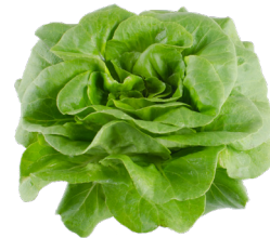
Green Rosette a tight, shallow head with petal-like leaves. sweet, crisp, slightly fruity