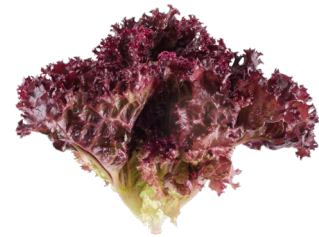
Lolla Rossa voluminous frilled leaves tipped with red. bright, balanced flavor