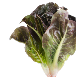
Red Rose long leaves fade from red to green with pink-tipped stems & pink veins. classic romaine flavor & crispness