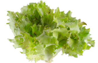
Painted Crispleaf tart & toothsome with celery notes