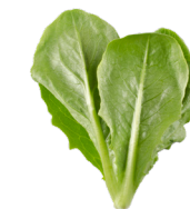
Ultra (u) Lettuce 3"-4" sold by pkg. or pound