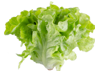
Green Oak brilliant emerald leaves with a hearty, soft body. sweet at the stem, bitter toward the tips *ultra and baby only