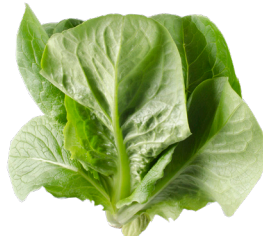
Baby (b) Lettuce 4"- 6" sold by pound