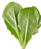
Ultra (u) Lettuce 3"- 4" sold by pkg. or pound