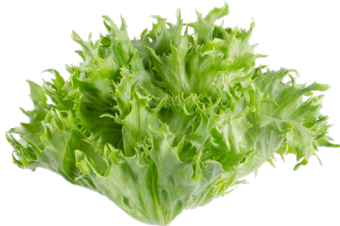
Reine D' Glaces succulent leaves with prominent veins. earthy & savory, with notes of carrot & celery. sweet at the stem, bitter at the tips