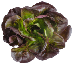
Red Rosette a broad head with tender petal-like leaves. slightly bitter & savory with notes of parsnip