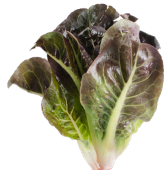
Red Rose long leaves fade from red to green with pink-tipped stems & pink veins. classic romaine flavor & crispness