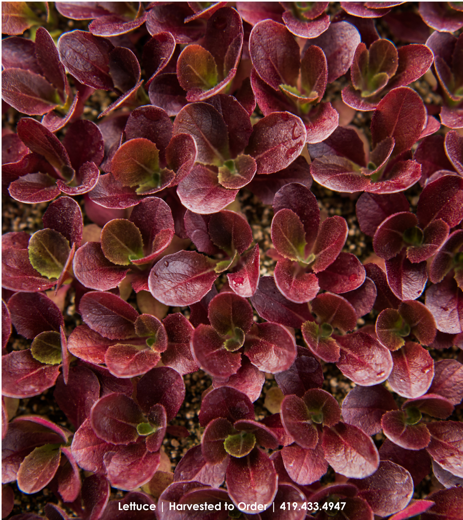
Lettuce | Harvested to Order | 419.433.4947