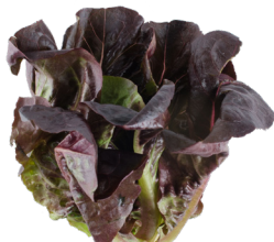
Red Romaine loose, red Romaine with crisp texture & mild flavor