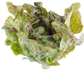
Painted Oak mild, earthy & balanced. speckled oak-shaped leaves with hints of carrot *petite only