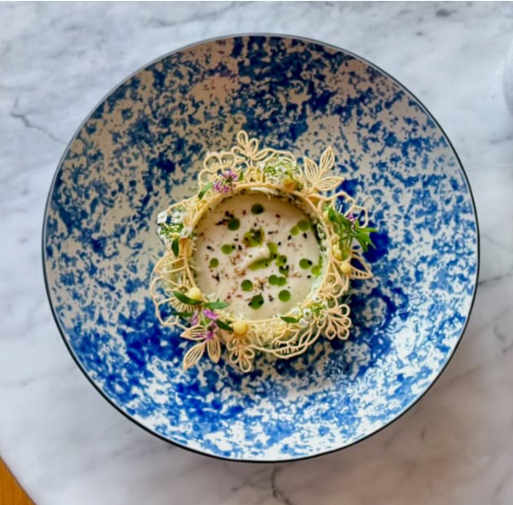
@chefbrandosalo Chilled Celery Root Soup Florida Stone Crab, Yagenbori, Preserved Florida Orange Sweet Alyssum