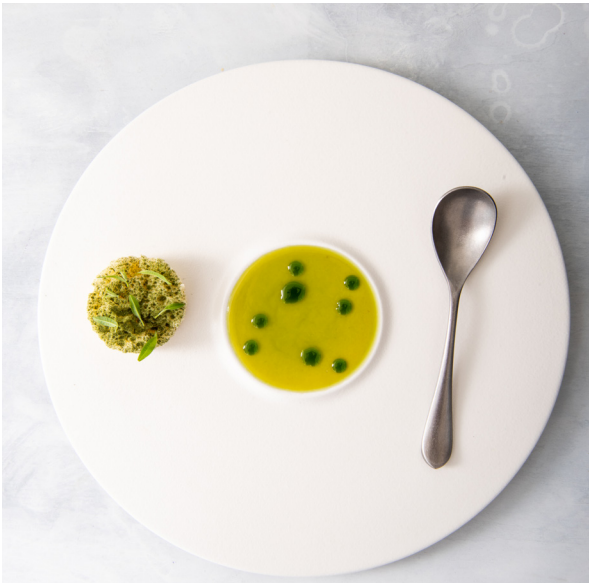
@culinaryvegetableinstitute Verbena Custard, Verbena Gel, Verbena Powder, Citrus Cake