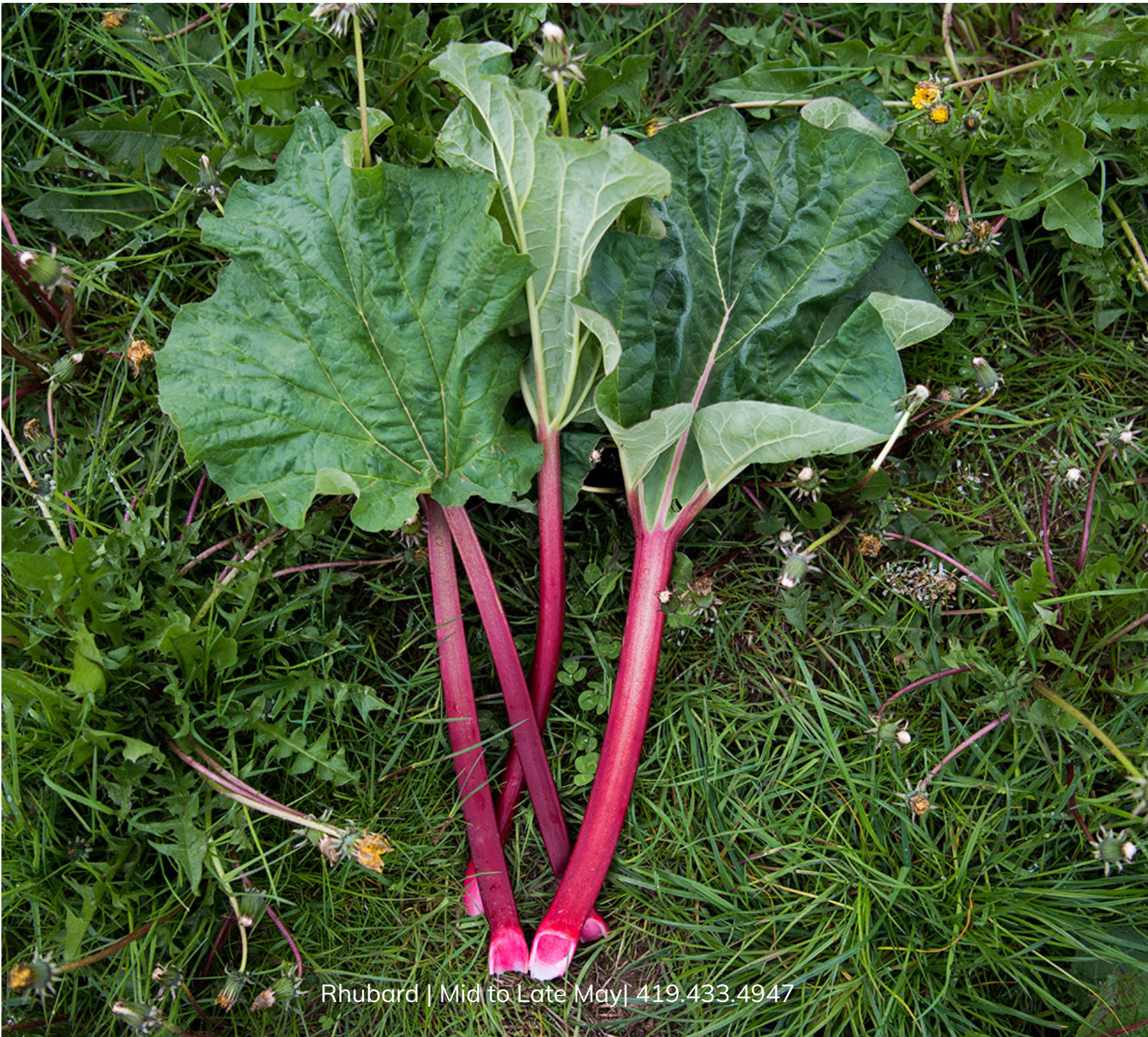
Rhubarb | Mid to Late May | 419.433.4947