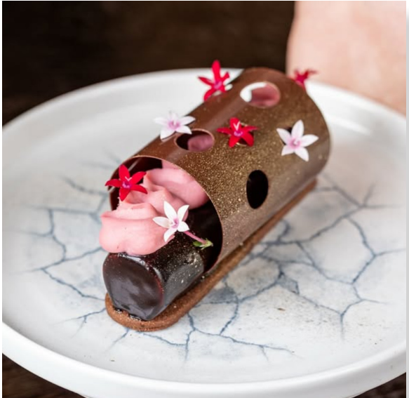
@chefbobbyrobby Flourless Chocolate Torte - Raspberry | Lavender | Midnight Cocoa

Yellow and Pink Pineapple Carpaccio, Compressed Pink Pineapple, Coconut Gelee, Pineapple Emulsion, Ginger-Rum Vinaigrette, Charcoal-Tajin Coral Tuile, Olive Oil Pearls, Local Flowers.