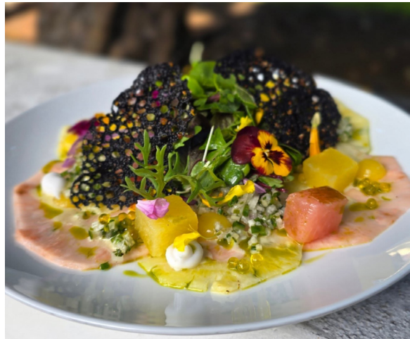
@chef.malcolm One of my favorite salads.

FEATURED DISHES We want to feature you, our loyal customers. Take photos of your dishes made with our products and share them on Instagram. Tag your posts with @farmerleejones and @thechefsgarden_ohio #thechefsgarden or email us at marketing@chefs-garden.com to be featured in our collateral.