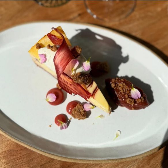
@alexandramcmillencavallo Rhubarb cheesecake 4 ways (gelled, stewed, candied, swirled in cheesecake) w/ biscoff crumb.